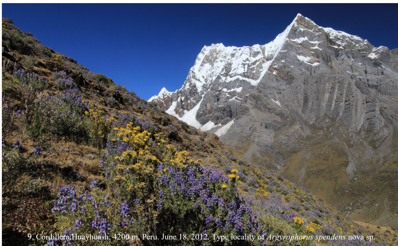
9. Cordillera Huayhuash, 4200 m. Peru. June 18, 2012. Type locality of Argyrophorus splendens nova sp.

When it is flying, this butterfly displays a stroboscopic flight as its shiny metallic dorsal wing surface is contrasting with its ventral dark colours. While resting on the naked soil with its