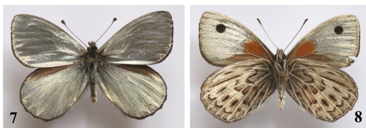
Argyrophorus argenteus ♂. R/V. Scale 1/1. Argentina, Neuquen, Villa de Angostura, 800 m, January 15, 2008, L. Manil leg. & photo

When it is flying, this butterfly displays a stroboscopic flight as its shiny metallic dorsal wing surface is contrasting with its ventral dark colours. While resting on the naked soil with its