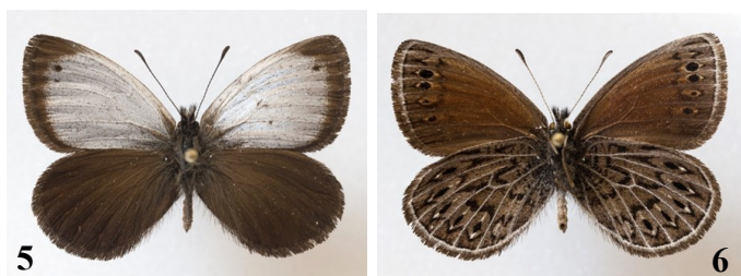
Argyrophorus lamna ♂. R/V. Scale 1/1 Cordillera Negra, near Conococha, 3950 m, Ancash, Peru, June 14, 2012, J. Delmas leg.

The underside pattern of this new species is extremely similar to the one of Argyrophorus lamna Thieme, 1904 from a nearby locality which suggest a recent divergence in speciation. These two species are very likely closely related within the Argyrophorus genus. This is also confirmed by the rather cylindrical antennae club found in both species, whereas there are spoon shaped in other Argyrophorus species (PYRCZ & WOJTUSIAK, 2010). When more specimen of this new species will be available, future investigations on this species position within the A. lamna group should have a focus on the FW venation as A. lamna displays four radial veins, which is so far a unique character among the Nymphalidae ((PYRCZ & WOJTUSIAK, 2010). Considering the geographic proximity between populations of these two species, it is not impossible that A. splendens and A. lamna are sympatric in some other localities. Still, while A. lamna is generally flying between 2500 and 4300 m, A. splendens was discovered in two very near localities above 4200 m and up to 4500 m. A. splendens could also be a high altitude vicariant species of A. lamna , restricted to high mountain ranges of central Peru. Other closely related species are A. angusta Weymer, 1911 and possibly the newly described A. blanchardi Pyrcz & Wojtusiak, 2010.